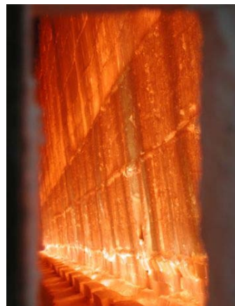
Figure 1 shows the IFB-lined lower sidewall in the upper terrace before being replaced with the Emisshield® - coated ceramic fiber. In figure 2, the color of the modules is darker and more even, showing that the Emisshield® - coated modules radiate more heat than the uncoated IFBs and that the radiation is more uniform. After eight months of service, the modules showed no sign of shrinkage and were not ablated.